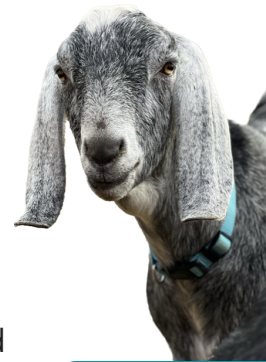
Bay, Nubian Goat